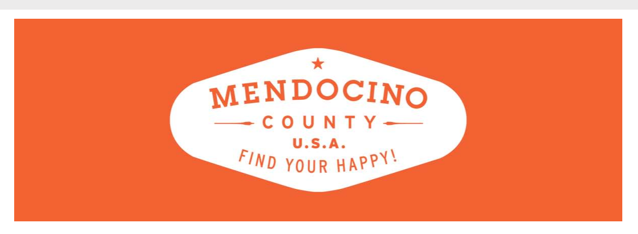
STAY | SEE+DO | EVENTS | EAT+DRINK